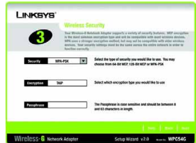
Figure 4-6: The Setup Wizard's WPA-PSK Screen

Click the Next button to continue. Click the Back button to return to the previous screen. Click the Help button for more information.